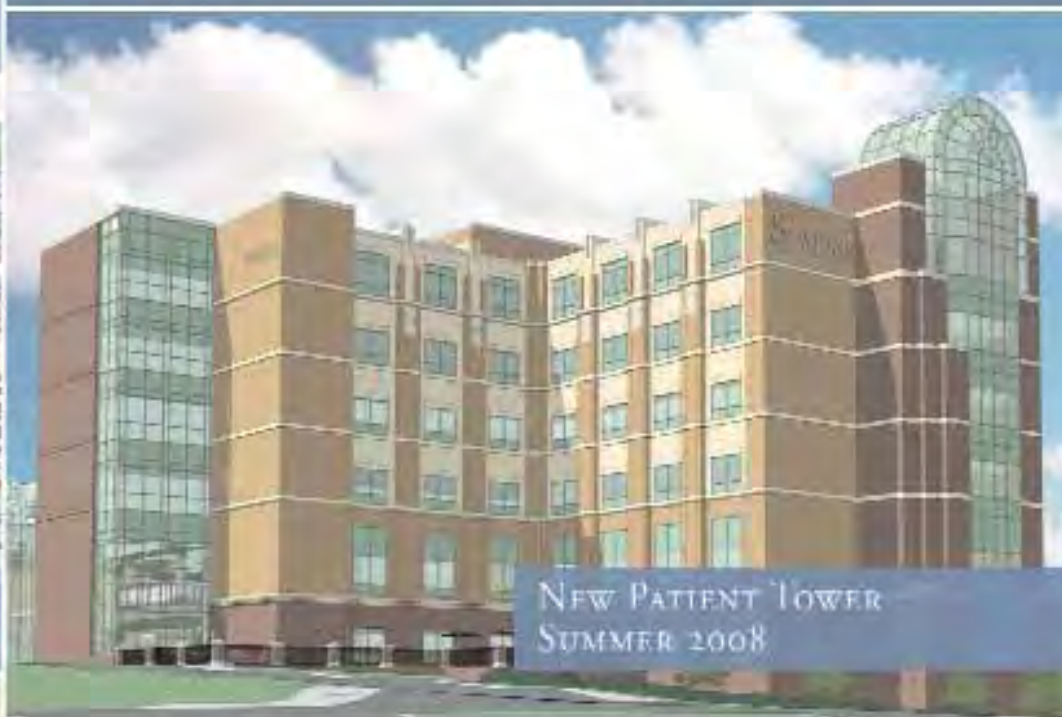
NEW PATIENT TOWER SUMMER 2008

555 Harrisville Pike Gallatin, Tennessee 37066