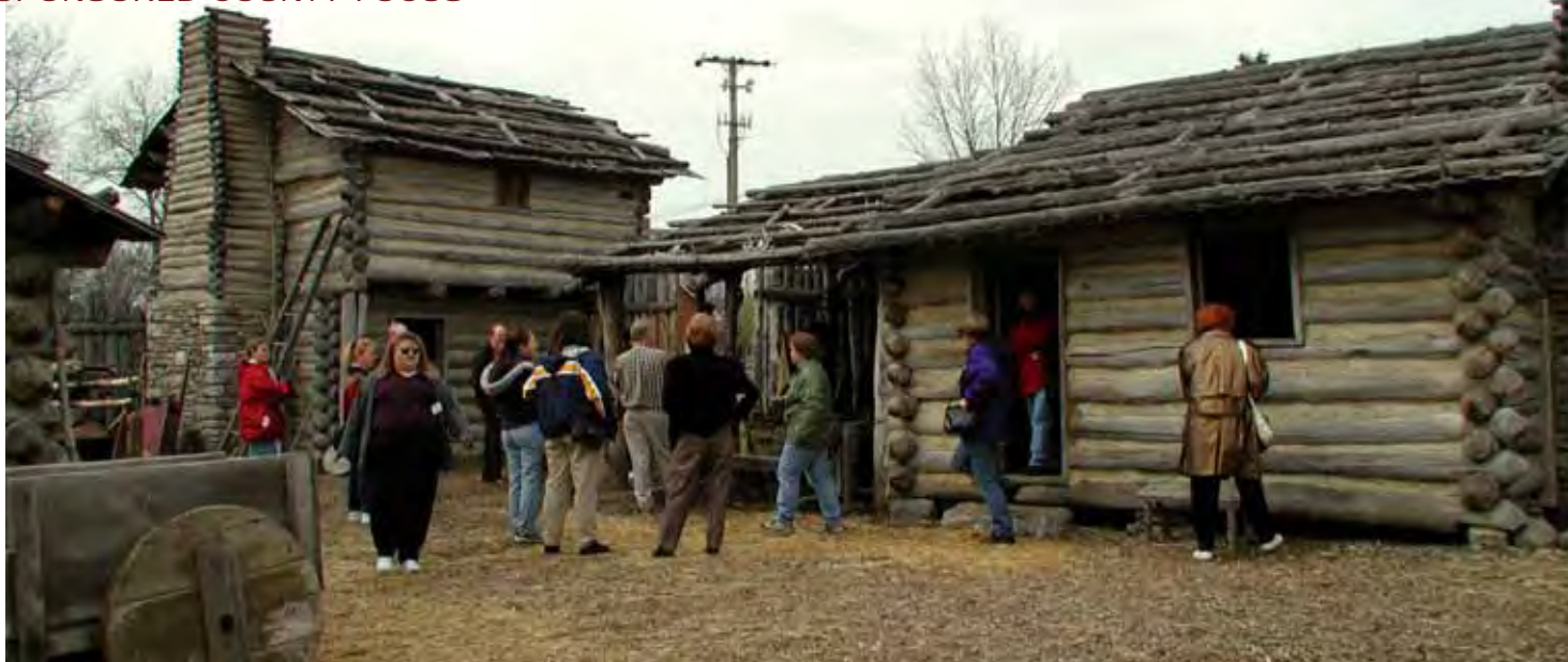
Mansker's Station Frontier Life Center

on the vine after the tornado of April 2006. A "supercell," spawned from a major tornado outbreak on April 6, devastated a 25-mile area of the county, resulting in the loss of nine lives, the destruction of approximately 1,500 homes and $400 million in damage. With infrastructure one of the biggest obstacles impeding growth in recent years, the destruction from