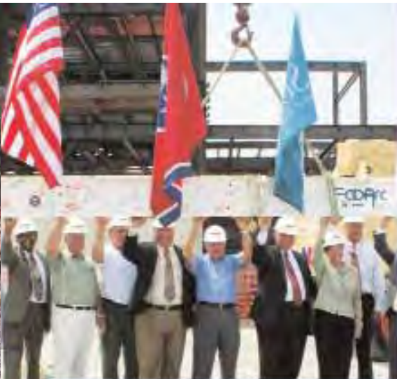
TOPPING OUT CEREMONY JULY 2007