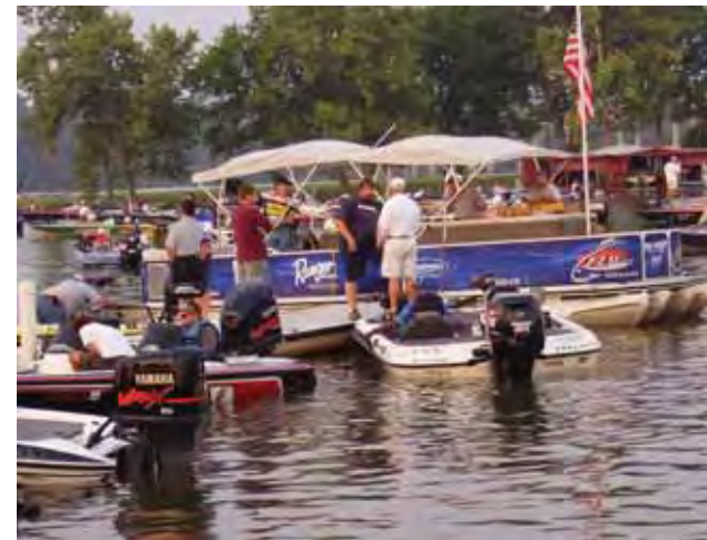
FLW Tournament on Old Hickory Lake