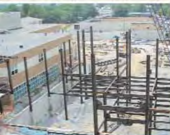
IN PROGRESS JUNE 2007