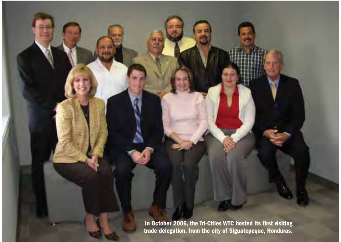
In October 2006, the Tri-Cities WTC hosted its first visiting trade delegation, from the city of Siguatepeque, Honduras.

skyscraper,” Siglan says, “but we’re looking at the WTC initiative in the Tri-Cities as positive economic development as opposed to real estate development, which half of the 300 WTC initiatives do concentrate on.”